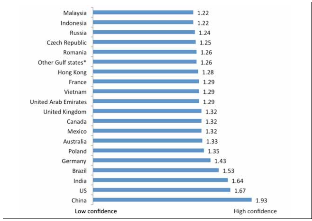
Figure 2: FDI confidence index, selected countries, 2010