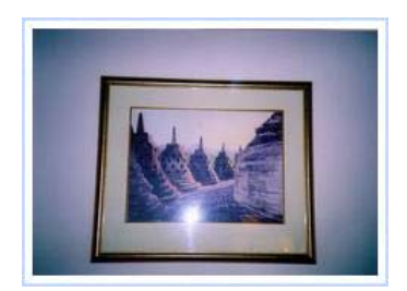
(Framed picture of Borobudur in hotel Hyatt Yogya)

I must admit that I am suffering from an overdose of Borobudur's presence -- in a way, Borobudur is definitely "living" since it is being reminded of at all times through