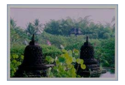
(Lightings which are shaped like the Borobudur stupas)

Just to make some clarifications in case some wonder why there is a need for me to stay in such a posh hotel. Well, I need to stay at hotel Hyatt for the first few days of my fieldwork because accommodation at the hotel is included in my air package. One observable phenomenon upon stepping into the premises of hotel Hyatt is that its architecture is like a mini replica of Borobudur -- most of the lightings found around the hotel are in the shape of a stupa, there are many framed pictures of Borobudur hanging on the walls of the hotel, some are of its architecture, while others are of its bas-reliefs, and these framed pictures of various sizes could be found in the restrooms too!