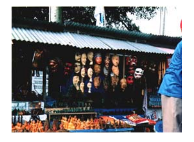
(Souvenirs sold during upacara Waisak)

It is amazing how, a Buddhist monument like Borobudur, has taken on a new role in contemporary Indonesia. While till today, no one is certain of the symbolism and function of Borobudur intended by its builders, Borobudur has certainly, in this present day, became a sort of commodity on which the residents of the Magelang province could capitalize on. If Borobudur were meant as a place of solace for the Buddhists in the past,