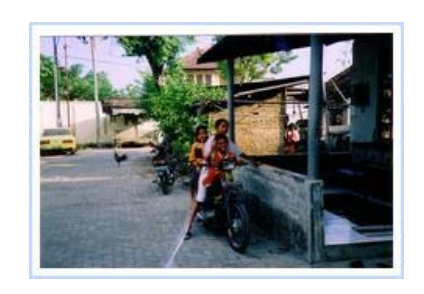
(Surroundings of my home stay)

Not that a home stay is bad or unbearable, in fact, I am fine with the environment of my home stay, but I would have preferred the "cleaner" and "better" facilities available at hotels -- blame it on my pampered "Singaporean privileged background" (of course there would definitely be Singaporeans who would protest against this remark, but at least in my own opinion, I do feel that I am privileged in terms of accommodation and general utility facilities).